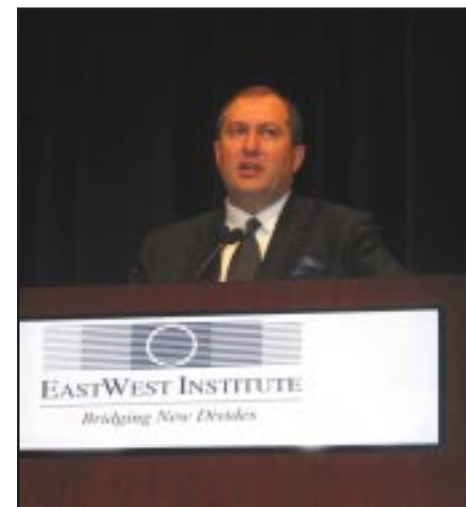
Armen Sarkissian addressing the conference