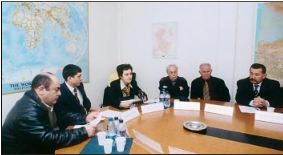
Panelists during the roundtable discussion

YEREVAN -- The National Citizens' Initiative (NCI) has convened a roundtable on "What Armenia's Citizens Gained and Lost in 2005." The meeting brought together political and social activists, human rights advocates, analysts, experts, and media representatives.