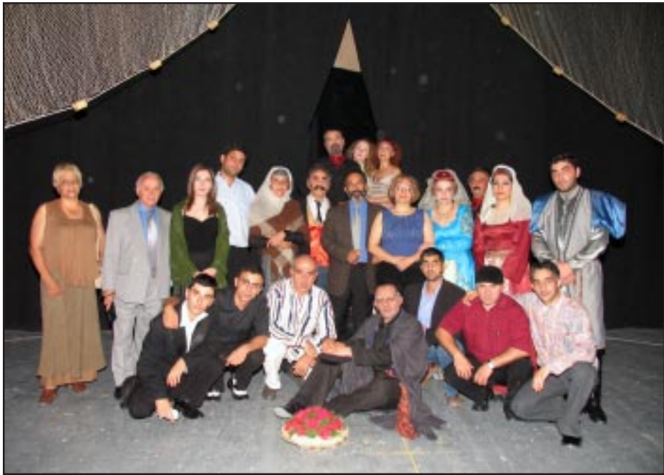
Petros Adamyan State Armenian Dramatic Theater Group

It is planned that the theater will go on tour in the cities with large Armenian communities in America and Canada.